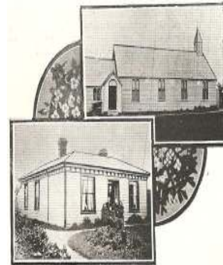
CHURCH AND PARSONAGE, WOODEND.

That the stained glass windows we presently have in the sanctuary were installed in July of 1921. They were not officially dedicated until October of that year.